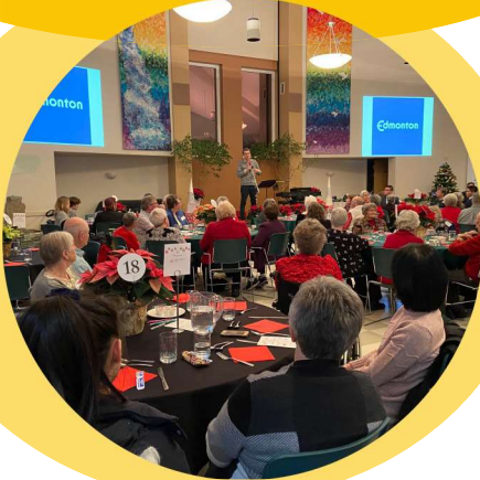
2019 HOLIDAY DINNER