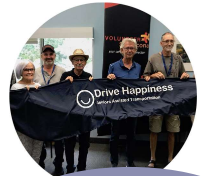
VOLUNTEER STRATHCONA LUNCHEON