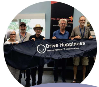
VOLUNTEER STRATHCONA LUNCHEON